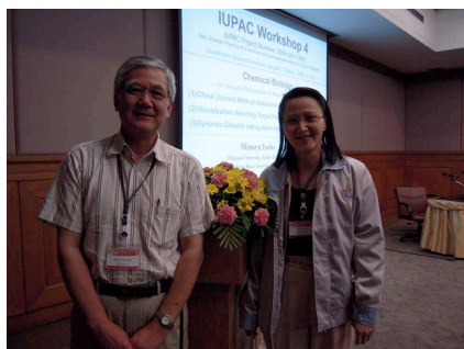
Chulabhorn Research Institute