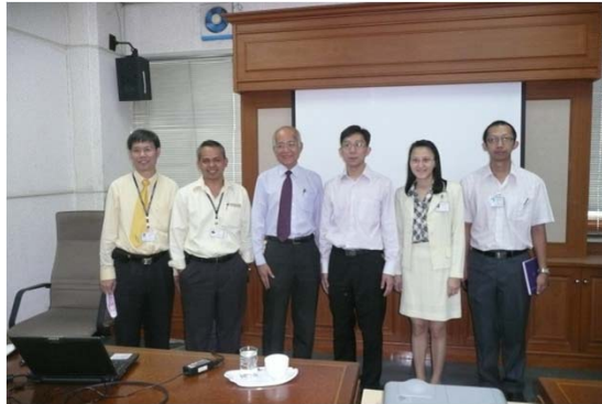
Lecture in Chulabhorn Research Institute

State Key Laboratory of Natural and Biomimetic Drugs, School of Pharmaceutical Sciences, Peking University