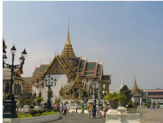
Visit The Grand Palace in Bangkok