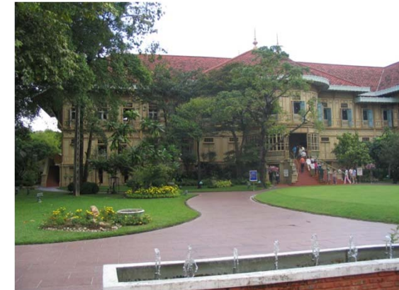
Visit Vimanmek Mansion in Bangkok