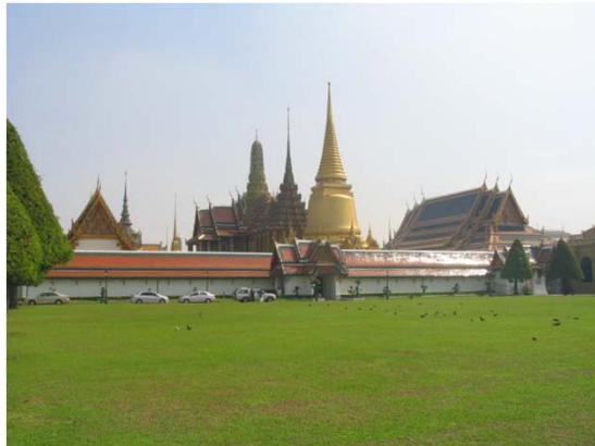
Visit The Grand Palace in Bangkok