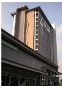
New Building of CGI