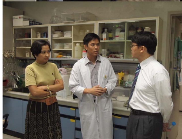
Lecture at Chulabhorn Research Institute