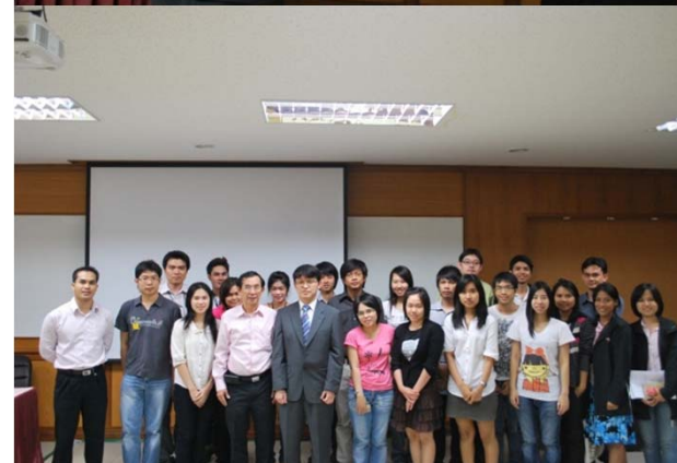
Lecture at Kasetsart University