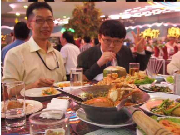
Seafood Market and Restaurant: If it swims, we have it.